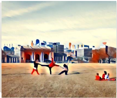
Beyond the Fourth Wall: Engaging Therapeutic Performance to Expand Our Impact on Communities

c) Coffee/Tea: Your sponsorship provides morning coffee/tea to conference attendees. This is a lovely touch that is much appreciated by our conference attendees. Cost of sponsoring coffee/tea is $600 per the day of your choosing. Other Value Added: Sponsors will receive recognition at the coffee/tea service table and can include a ½ page program advertisement or a registration packet insert at no additional cost.